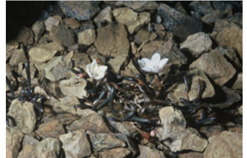
Dun Saddle (January). Photographer: John Smith-Dodsworth, Licence: CC BY-NC.