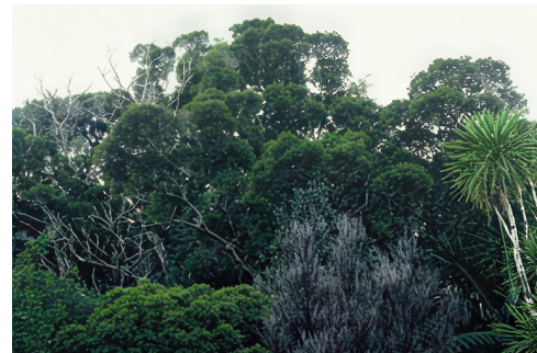
Metrosideros bartlettii tree, Radar Bush, Te Pahi.