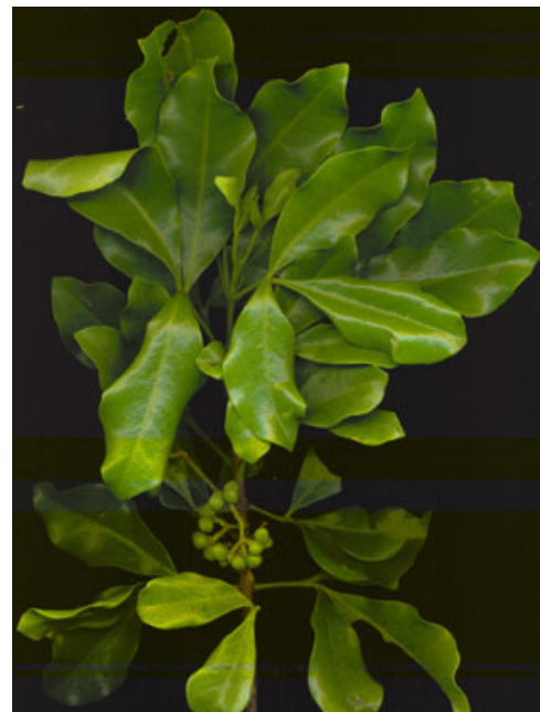
Melicope ternata . Photographer: Wayne Bennett, Licence: CC BY-NC.