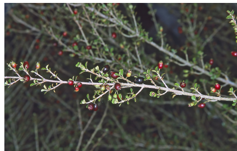
In cultivation.