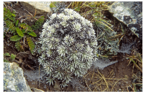
Mount Peel. Jan 1993.