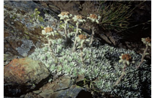
Big Mt Peel, Canterbury.