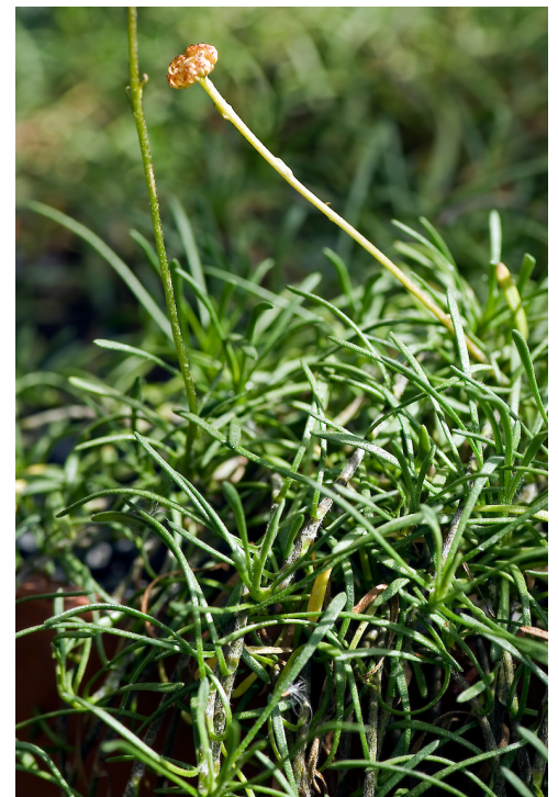
In cultivation ex Red Hills. Date taken: 15/03/2007, Licence: CC BY.