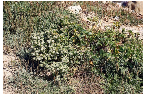
Aramoana Mole. Nov 2009.