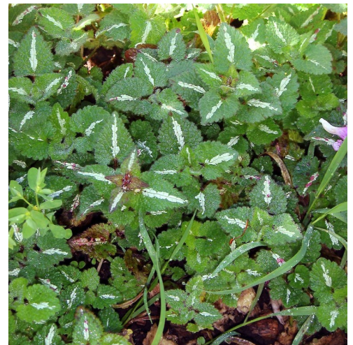
Hamilton. Oct 2011. Photographer: Peter J. de Lange, Licence: CC BY-NC.