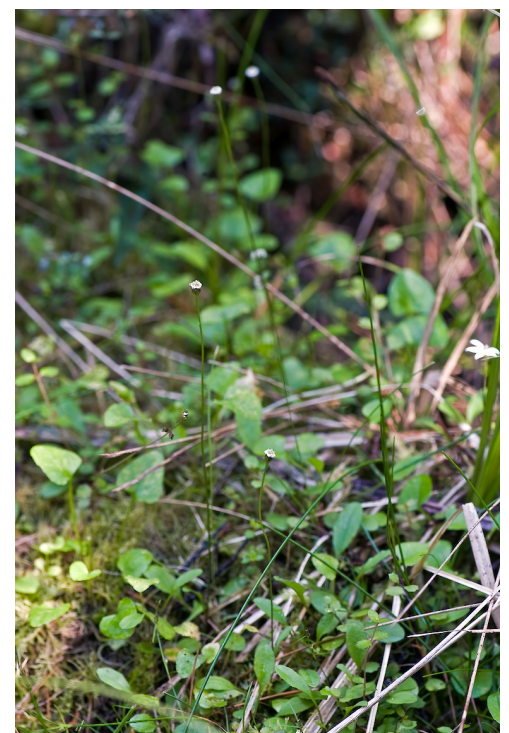
Habitat of Lagenophora schmidiae. Kuratau. Date taken