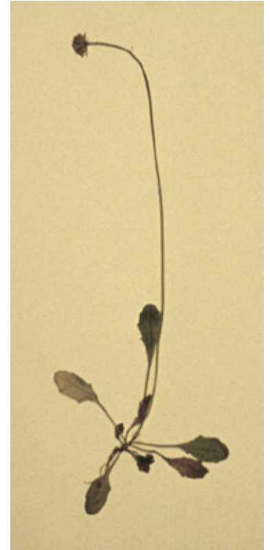
Herbarium specimen of Lagenophora schmidiae .