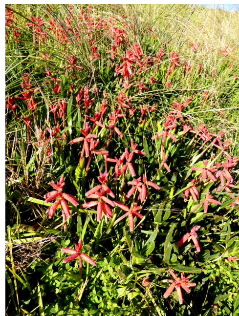
Dunes; Bamber St, Castlecliff, Whanganui. Photographer: Colin C. Ogle, Date taken: 20/06/2017, Licence: CC BY-NC.