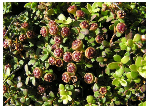
Intact capsule, Pilch Point, June 2008. Photographer: Simon Walls, Date taken: 18/06/2008, Licence: CC BY-NC.