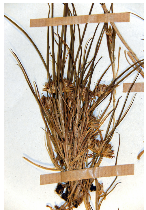
Herbarium specimen: AK 137541. Photographed with permission of Auckland Institute and