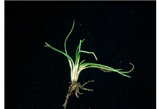
Wairakei.