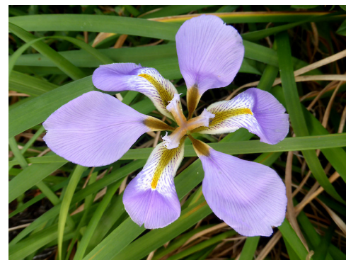
First flower of the autumn; Garden, St John's Hill, Whanganui. Photographer: Colin C. Ogle, Date taken: 01/03/2020, Licence: CC BY-NC.