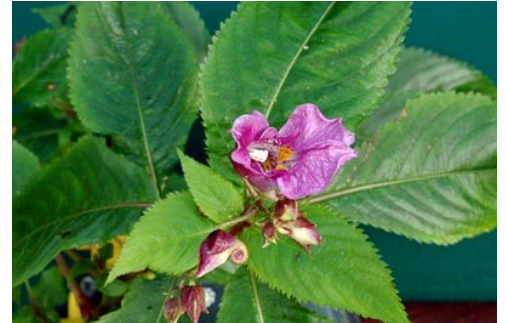
Naturalised in a Whanganui garden. Mar 2009. Photographer: Colin C. Ogle, Licence: CC BY-NC.