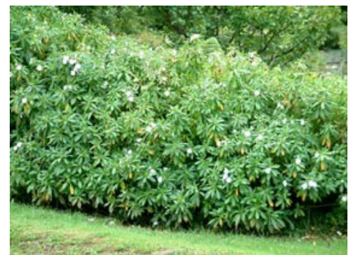
Impatiens sodenii . Photographer: John Smith-Dodsworth, Licence: CC BY-NC.