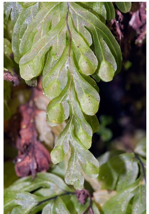
Upper Hutt. Date taken: 11/07/2006, Licence: CC BY.