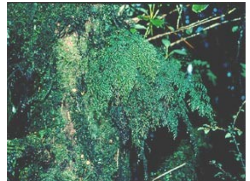
Mt Te Aroha.