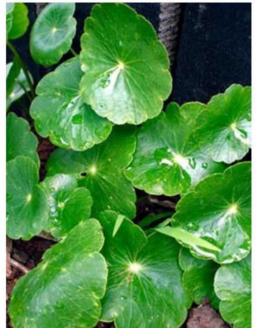
Hydrocotyle umbellata close up of wild plant, Asquith Ave, Mt Albert, Auckland. Photographer: Peter J. de Lange, Date taken: 18/12/2006, Licence: CC BY-NC.