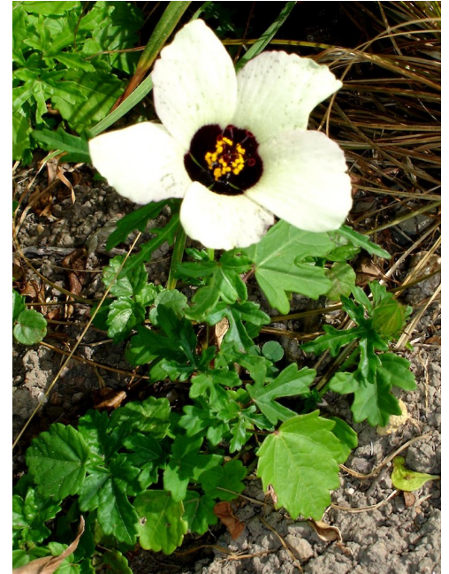
Hibiscus trionum . Photographer: Peter J. de Lange, Licence: CC BY-NC.