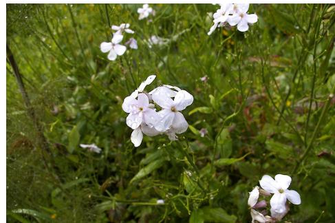
Hesperis matronalis.