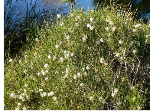
Lake Wiritoa. Jun 2012. Photographer: Colin C. Ogle, Licence: CC BY-NC.