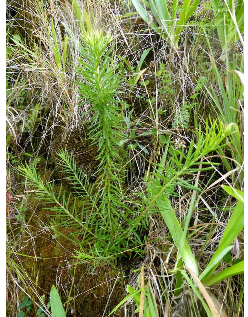
Wild seedling, Whanganui. Photographer: Colin C. Ogle, Date taken: 15/03/2015, Licence: CC BY-NC.