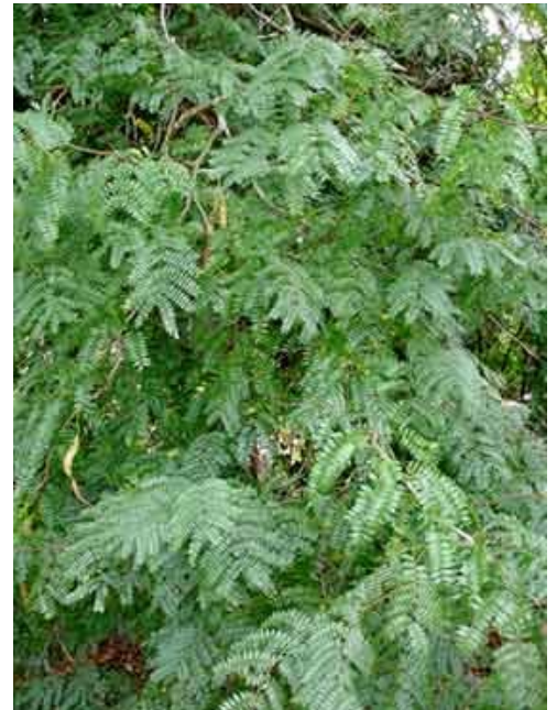
Adult foliage (Planted Tree), St Lukes Road, Mt Albert, Auckland, Mar 2007. Photographer: Peter J. de Lange, Licence: CC BY-NC.