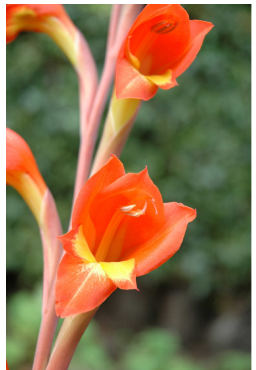
Garden, Whanganui. Photographer: Colin C. Ogle, Date taken: 27/05/2011, Licence: CC BY-NC.