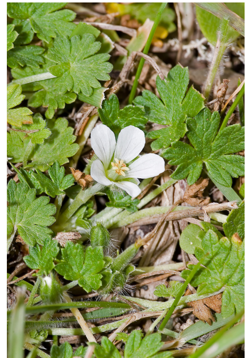
Terawhiti Station, Wellington.