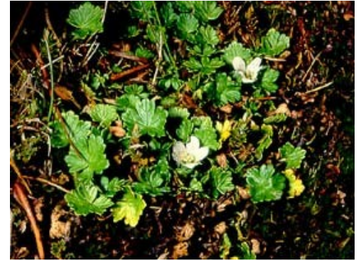
Flowering plant, Hauhungaroa Range (December). Photographer: John Smith-Dodsworth, Licence: CC BY-NC.