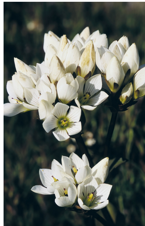
Tararua Forest Park.