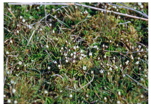
Northern Dunstan Range.