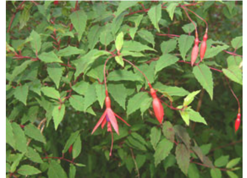
Coromandel. November.