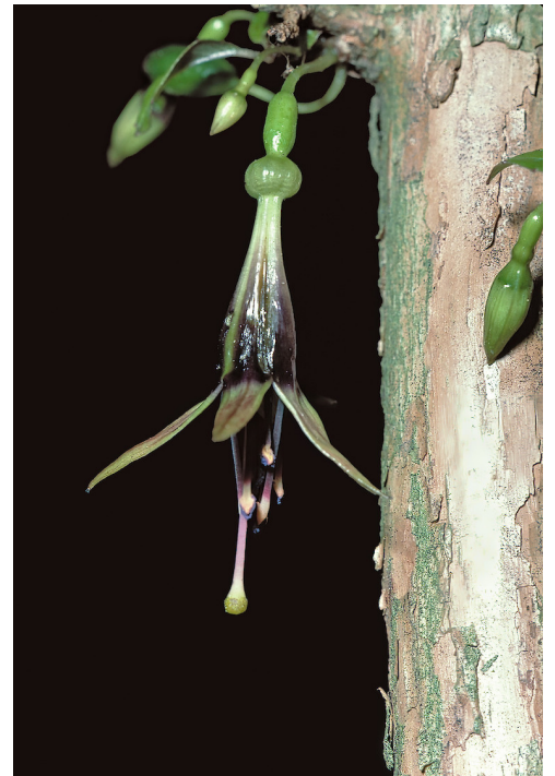
Christchurch. October 1981.