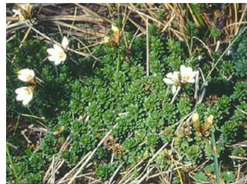
Mt Arthur February.