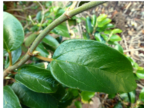
Adult foliage; semi-escaped along old stone wall; Taylor St, Whanganui. Photographer: Colin C. Ogle, Date taken: 20/03/2013, Licence: CC BY-NC.