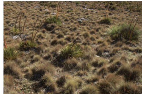
Pisa Range, Central Otago. Photographer: Kelvin Lloyd, Licence: All rights reserved.