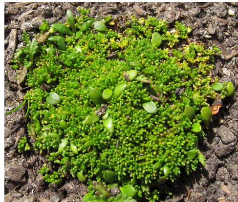
Ex. Black Point, Southland. Photographer: John Barkla, Licence: CC BY.