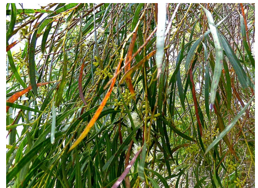
Foliage. Planted specimen. Bulls. Dec 2012.