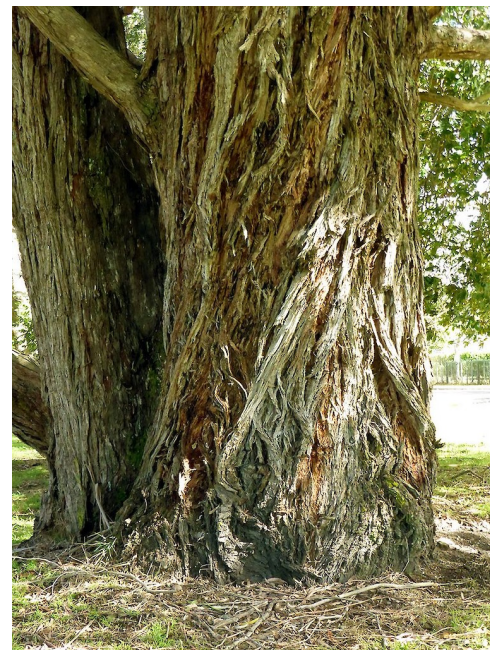
Trunk base, Aramoho. Photographer: Colin C. Ogle, Date taken: 20/04/2014, Licence: CC BY-NC.