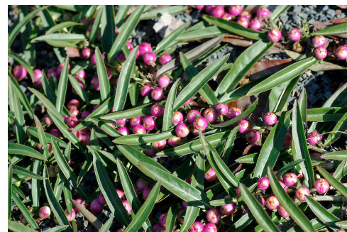
Naturalised at Oratia.