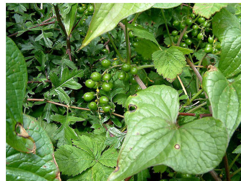
England. Photographer: John Smith-Dodsworth, Licence: CC BY-NC.