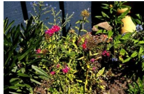
Dianthus barbatus . Photographer: John Smith-Dodsworth, Licence: CC BY-NC.