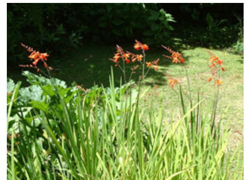
Crococsmia x crocosmiiflora . Photographer: John Smith-Dodsworth, Licence: CC BY-NC.