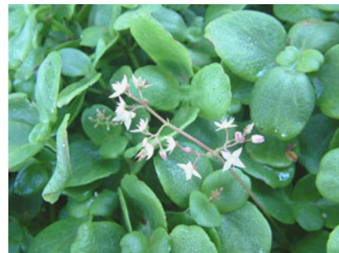
Papa Aroha, November.