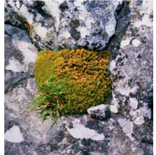
Close up of plant. Photographer: Brian P. Molloy, Licence: CC BY-NC.