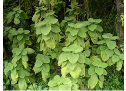
Plectranthus grandis showing growth form. Photographer: Richard Hursthouse, Licence: CC BY.