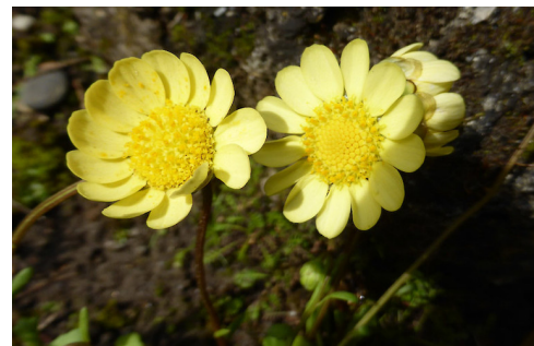
Gravel waste area; central Whanganui. Ray (ligulate) florets cream to pale yellow. Photographer: Colin C. Ogle, Date taken: 09/10/2016, Licence: CC BY-NC.