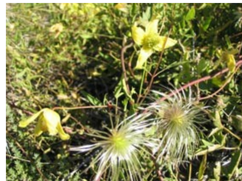
Clematis tangutica.