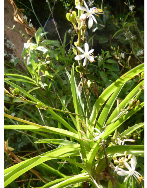
Waste area under trees, by carpark at 'Windermere Gardens', Westmere, Whanganui. Photographer: Colin C. Ogle, Date taken: 12/03/2015, Licence: CC BY-NC.