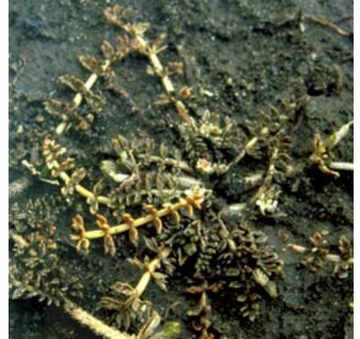
Close up of Oreomyrrhis colensoi var. delicatula .