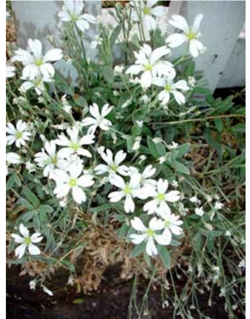
Auckland. Nov 2006.