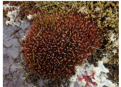
In tarn, thousand acre plateau. Photographer: Marley Ford, Date taken: 07/01/2021, Licence: CC BY-NC.