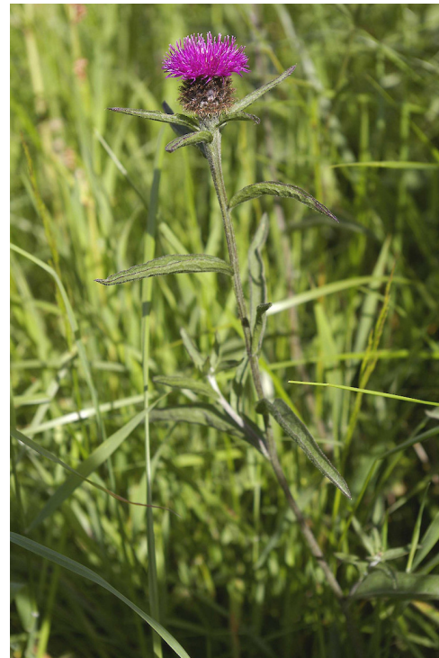
Centaurea nigra.